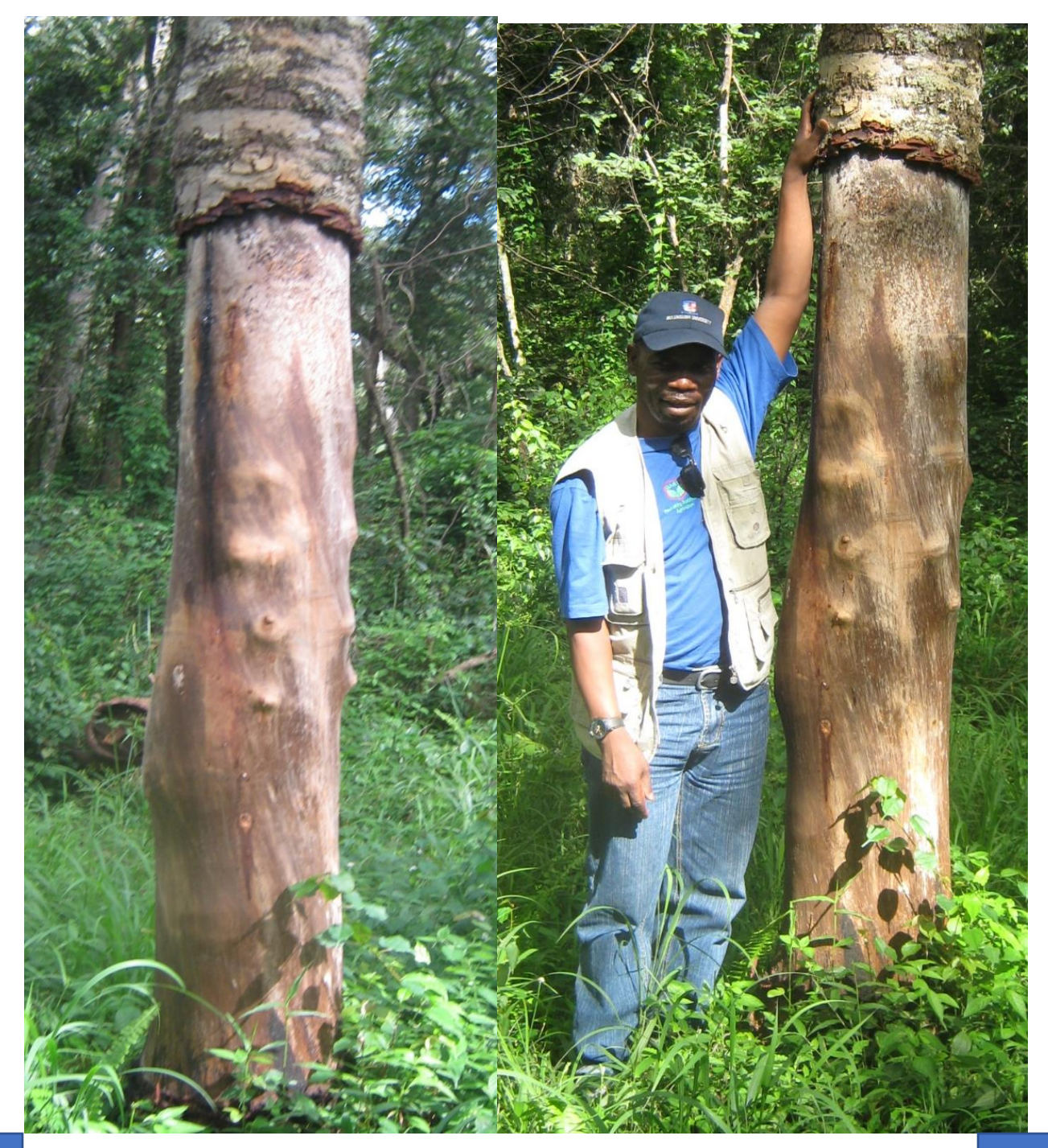
(c) Fig. 4c, d Dead Brachystegia spp after being debarked to make bee hives.