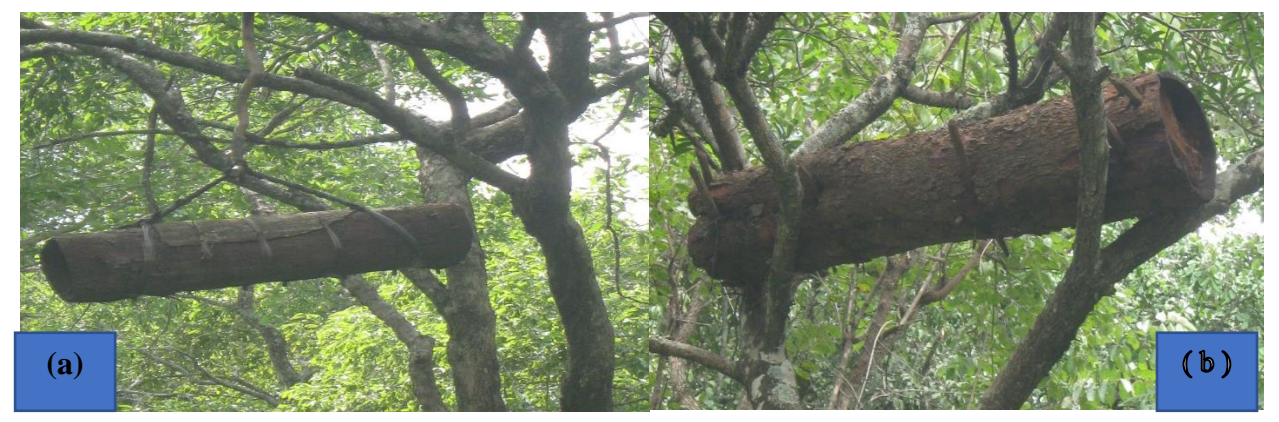
Fig. 4 a) Bee hives made from tree bark suspended by hooking it on a branch, b) paced on tree fork, Mwinilunga, Zambia

Fig. 3a) The 210 plastic drum containers loaded with bee honey awaiting transportation for export to foreign markets, b) plastic bucket containers supplied to bee keepers under the out-grower scheme, Mwinilunga, Zambia All beehives used by the 5,000 members of the out-grower scheme were made of cylindrical tree bark hives debarked from mainly Brachystegia spp; ( Brachystegia spiciformis, Brachystegia bohemii and B. longifolia ) while Julbernardia paniculata pollen was recorded to be the best in the production of clear honey as also earlier recorded by Storrs (1982). The bee hives had a capacity to produce 20 - 30 litres of honey each, and were mainly stacked at the folk of trees or hooked to hang from a branch (Fig. 4, a, b). The life span of these tree bark hives was only up to 8 years after which they are replaced. All the trees observed during the survey from which barks and been removed for the preparation of bee hives had died (Fig.4c, d).