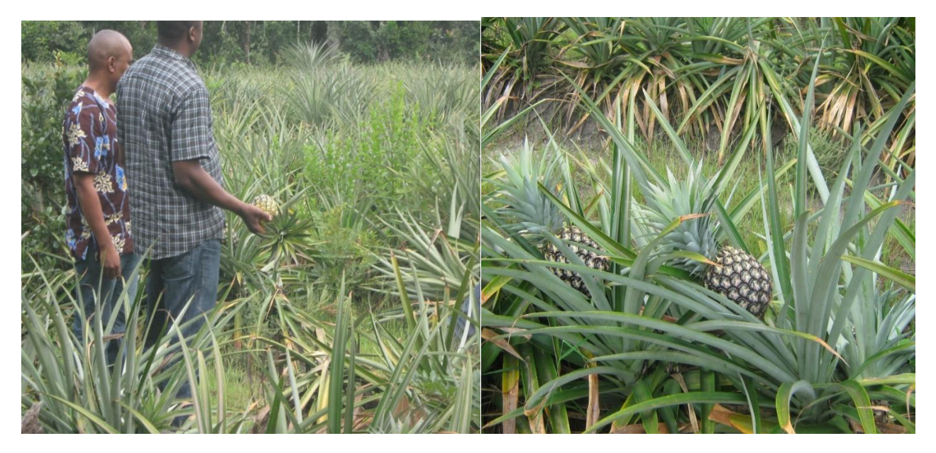
Fig. 5 Research team members in a pineapple garden near the Zambezi River source, Mwinilunga

The area also supports pineapple growing by small holder farmers (Fig. 5). The collective effort of small scale farmers cumulatively yields large quantities for the urban market. In general terms, however, the Lunda speaking people of Mwinilunga are traditionally hunters and gatherers with little interest in agricultural activities. It would therefore, be assumed that the growing of pineapple is a consequence of the high rainfall regime which naturally favours this water loving plant rather than being an acquired skill.