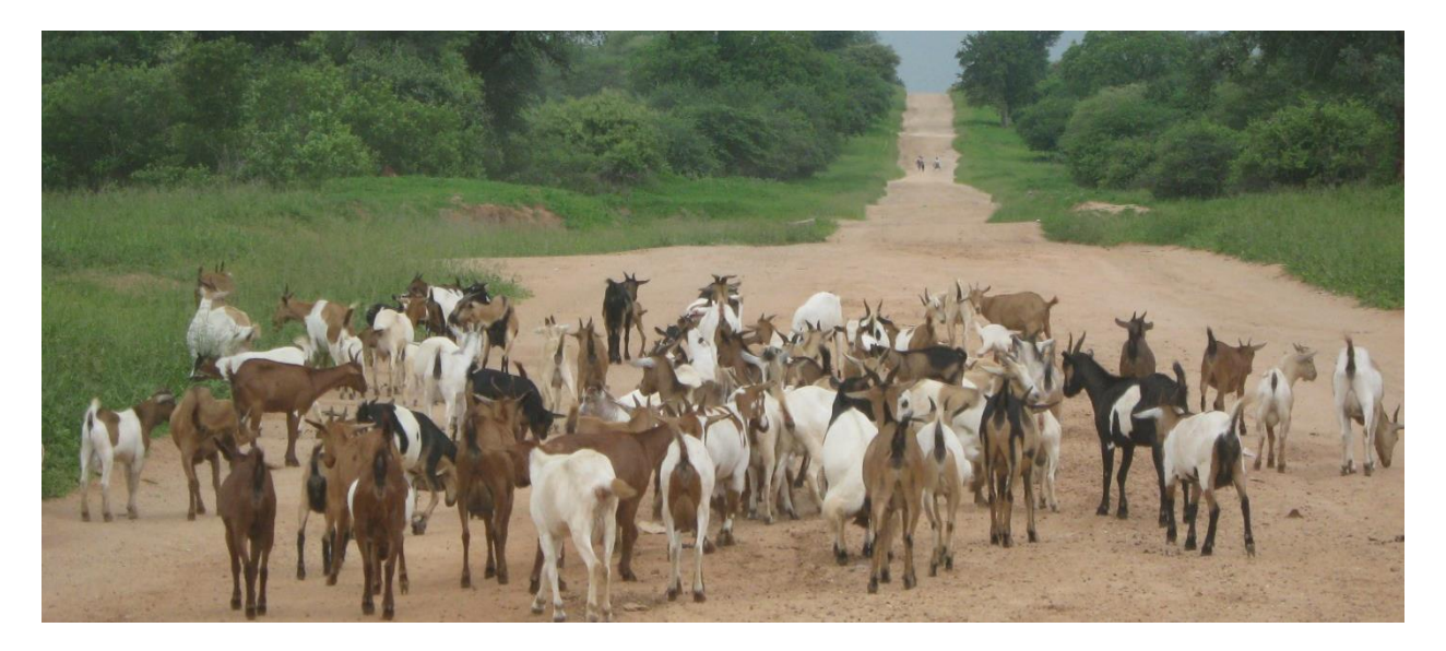
Fig. 9 Small livestock, goats (Capra spp) in Chiawa village, Lower Zambezi, Zambia

Agriculture and fishing were the dominant livelihood activities particularly in the Sinazongwe area. Fishing on Lake Kariba by both commercial and artisanal fishers are mainly dependent on a fresh water sardine locally called Kapenta (Limnothrissa miodon) , tiger fish ( Hydrocynus vittatus ), breams ( Oreochromis spp) and others. Livestock reared include cattle and small ruminants mainly goats (Fig. 9) and to a lesser extent sheep. Because of the dry conditions, pastures are very poor, which contributes to the poor body condition particularly in the latter part of the dry season (August to early November) (ZCRS, 2003). Keeping of cattle in Chirundu is further constrained by the areas' proximity to a Game Management Area and National Park which are reservoirs for tsetse fly ( Glossina spp) which carries protozoan parasite that causes trypanosomiasis in cattle and sleeping sickness in humans.