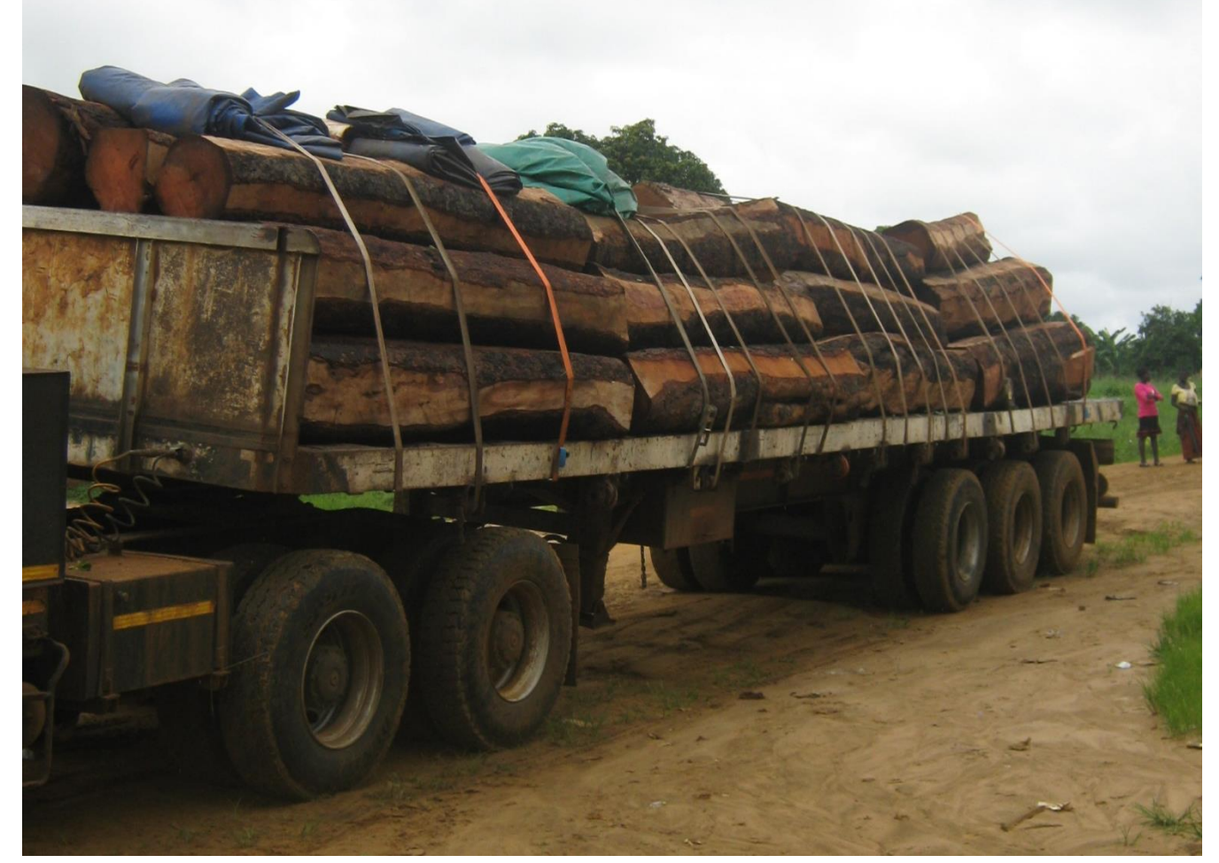
Fig. 7c) Loaded truck with Mukula ( Pterocarpus chrysothrix ) and Rosewood logs en-route to Lusaka. (Notes: Horse and vehicle number plate deliberately omitted from the picture for security reasons)