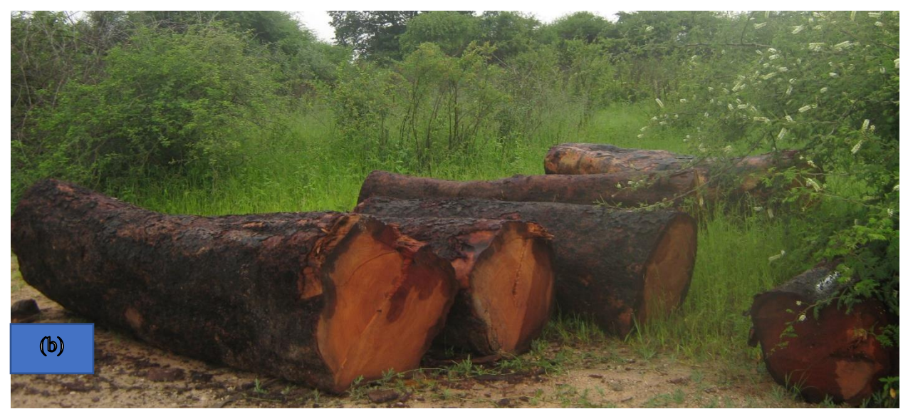
Fig. 7a, b) Logs of Rosewood (Guibourtia coleosperma) awaiting transportation to Lusaka