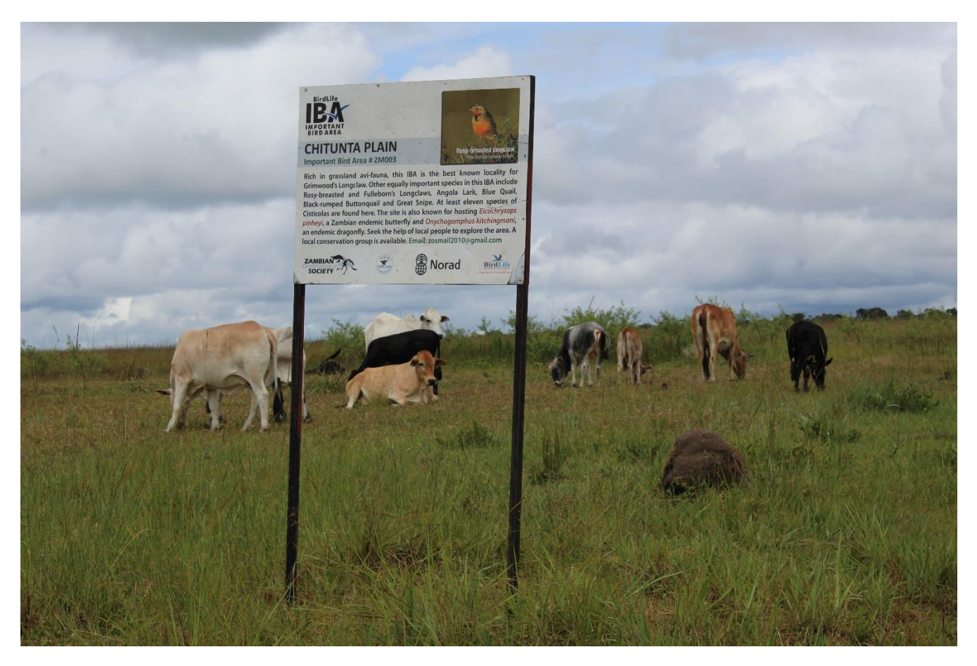
Fig. 6 Chitunta plain with abundant pasture for herbivores, Mwinilunga, Zambia