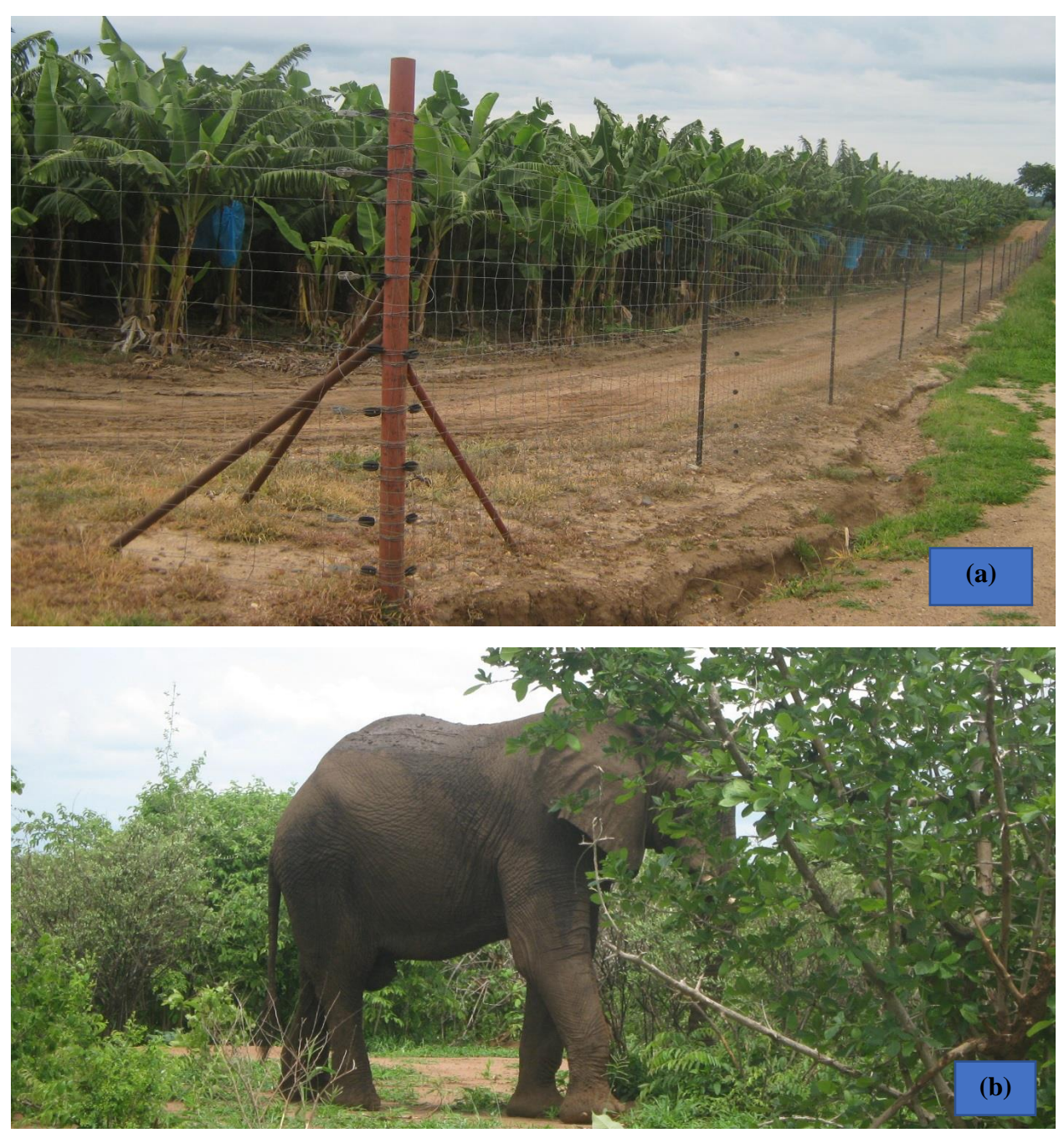
Fig. 10 a) Banana ( Musa spp) plantation, b) Elephant ( Loxodonta africana ) in Lower Zambezi National Park, as a tourist attraction

In the Chirundu area in particular, communities also earn extra income through wage employment in large commercial farms and tourism activities (Fig. 10a, b; c)