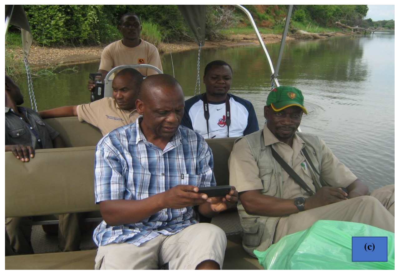
Fig. 10c Boat cruising as a recreation activity, providing employment opportunities for local communities in Chiawa area.