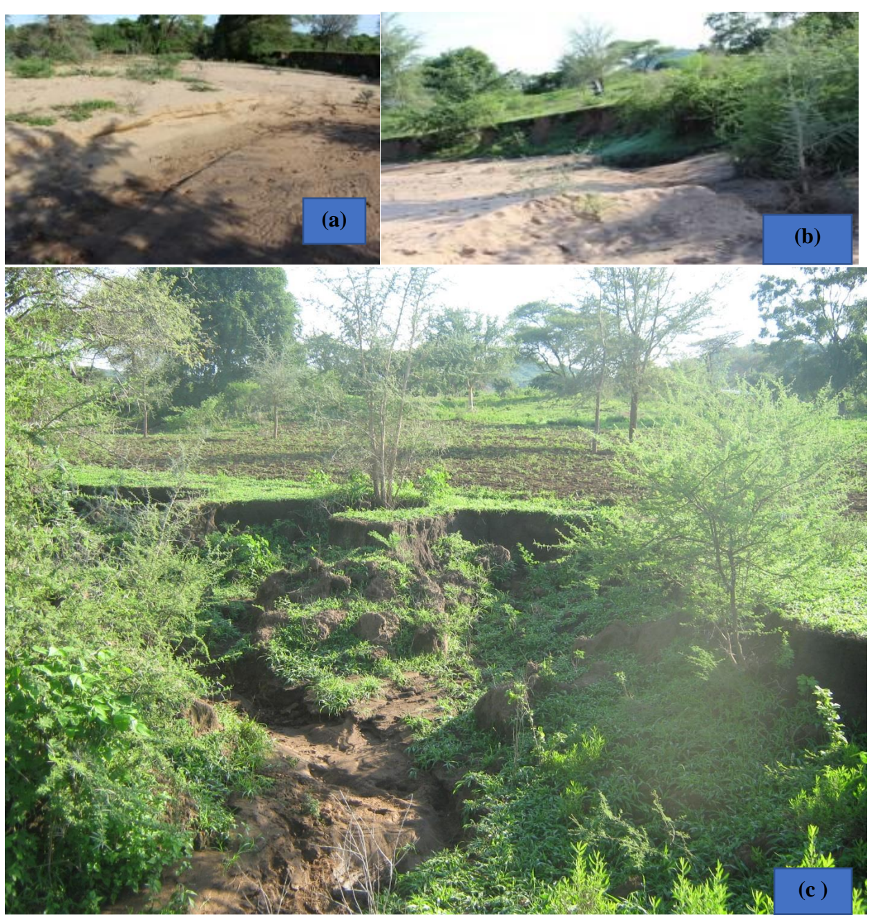
Fig. 11: Soil erosion, a) river bed deposition, b) river bank erosion and, c) gully erosion and sediment deposition on river beds in Sinazongwe Area of Lower Zambezi